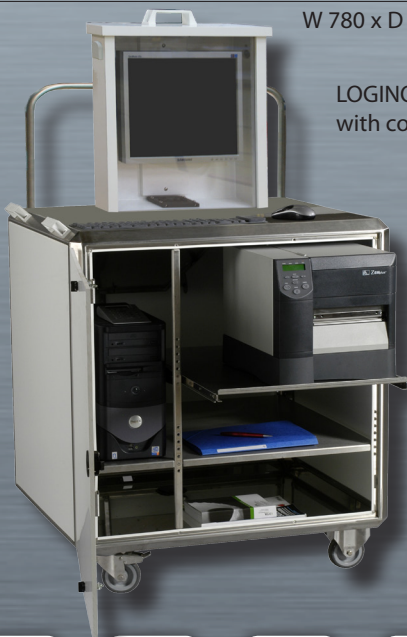
LOGINOX LCD with computer hardware