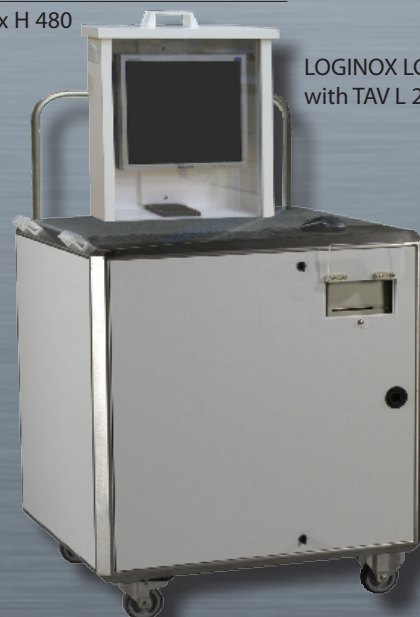
LOGINOX LCD with TAV L 24 hatch