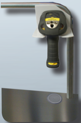
PISTOL GRIP MOUNT