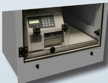
TAV L12 slot