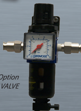
Option PRESSURE-RELIEF VALVE