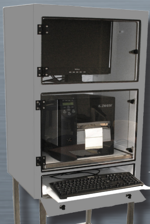
CPI with shelf for keyboard extended