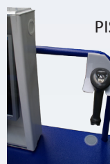
PISTOL GRIP MOUNT