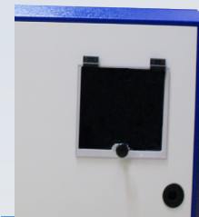
TAV L24 slot