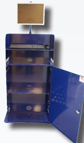
Front panel door open